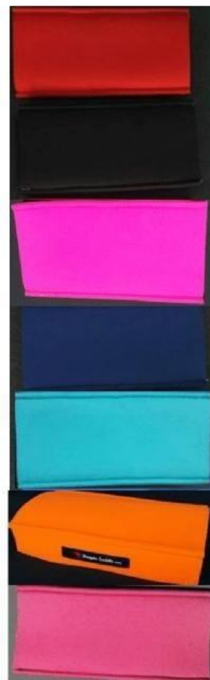
Burgundy (much darker than shown in picture) More of a wine colour